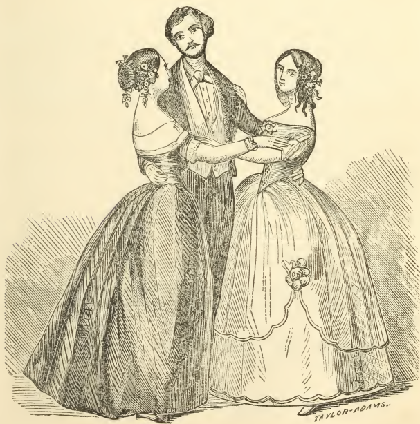
FANCY FRENCH COTILLON.

In the middle of the room are placed four chairs arranged in the same way as for Puss in a corner . Four couples set off, in waltzing or polking, and place themselves, each couple behind one of the four chairs. At a given signal each one waltzes or polks about the chair behind which it finds itself, and then passes to the next, and so on for the rest, always going to the right. This figure should be executed simultaneously to avoid clashing with each other. To finish, each couple regains its place in waltzing or polking.